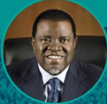
H.E. Hage G. Geingob President of the Republic of Namibia

With a lively panel discussion featuring: